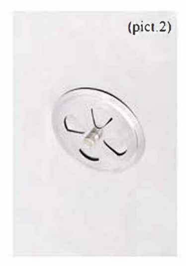
Air inlets (pict.1-2)